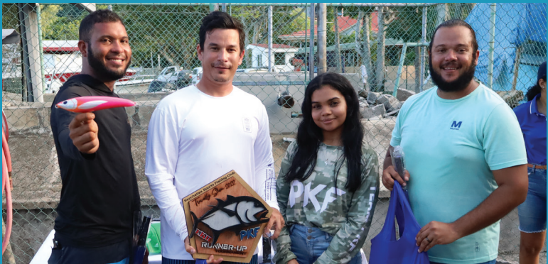
Team Rasta Shark: Runner-Up of the Trevally Slam Tournament 2022.