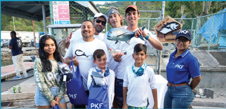
Team Big Boy Toys: The Winners of Trevally Slam Tournament 2022.

After a long day at sea, Team Big Boy Toys were declared as the winner of the tournament, while Team Rasta Shark were placed as the Runner-Up.