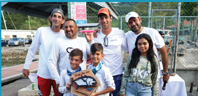
Team Big Boy Toys: Winner of the Giant Trevally category.

A total of five fishing team competitors participated in the tournament, and the categories up for grabs were: Giant Trevally, Yellow Spot Trevally, Bluefin Trevally, Bludger Trevally, Other Trevally, Runner-Up, and Winner of the Tournament.