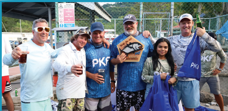
Team PKF: Winner of the Bluefin Trevally category.

Furthermore, all the participating fishing teams had to abide by the rules of the International Game Fishing Association (IFGA) for this tournament.