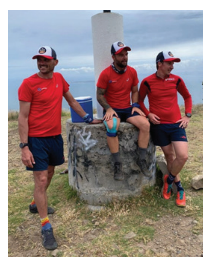
After 30 hours of both fun and pain we managed to finish arguably one of the most scenically stunning runs in the world and likewise one of the toughest events we have ever done."

Between peaks 12 and 13 we descended towards Kirstenbosch and along the Newlands contour which made me feel like Bilbo Baggins walking through the stifling Mirkwood forest, especially with the odd spider web wrapping around your face. Once through this section it was the final climb – aptly named Devils Peak. Here we had pumping wind and rain which made us feel even more hardcore as we reached the top. Mustering up a smile for a selfie we then headed home to Signal hill.